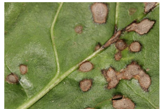
Cercospora attack in sugar beet