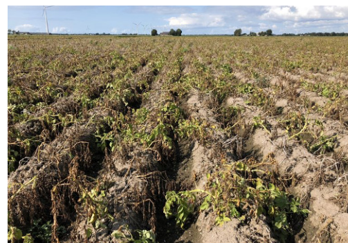
Foliage killing in potato